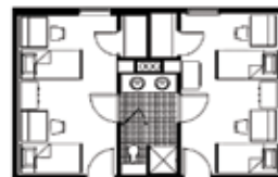
Typical Double Suite with pass-thru bathroom

Completed in the fall of 2000, Heritage Commons was the heart of the 2002 Olympic Winter Games, the Athletes' Village. What then housed Olympians now houses U of U students, in style. Consisting of 1,700 residence hall beds all accommodations are suite style. Double suites contain two bedrooms, each with two twin beds and a shared bath. Single suites contain two bedrooms,