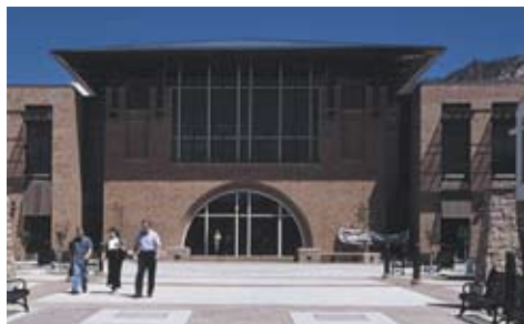
The Chase Peterson Heritage Center

Beyond housing, we take pride in planning every aspect of your conference. Special events and dining options are no problem, either.