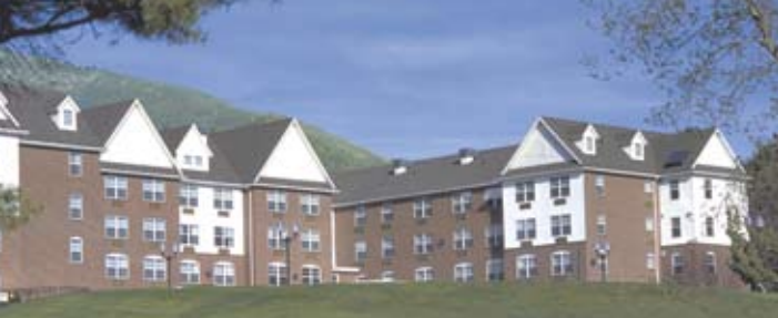
University Guest House